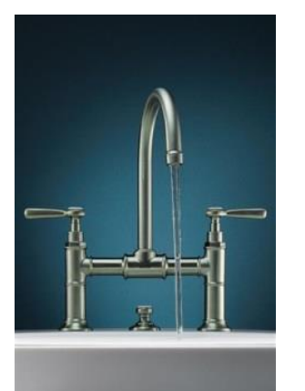
Axor Montreux_Washbasin_ 3 Hole Bridge

Reminiscent of the archetypical design of the first industrially manufactured bath and kitchen fixtures, Axor Montreux is characterized by additive forms and charming stylistic detailing. Industrial design elements, such as pipes and valves, were not only combined with classical details (e.g. delicate cross handles and ceramic inlays), but also with contemporary lever handles.