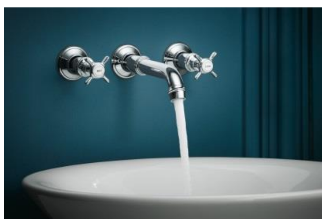
Axor Montreux_Washbasin_3 Hole_Cross Handles

A unique reminiscence of this time also includes a bridge variant of the three-hole washbasin mixer. With cross handles and authentically labeled ceramic inlays it is a genuine reminder of the first industrially manufactured fittings.