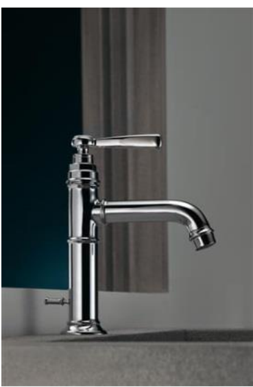
Axor Montreux_Washbasin_Cross Handles